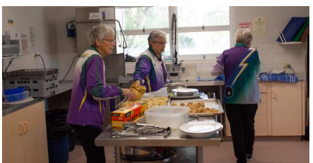
Some of the hard workers behind the scenes in the kitchen.

There are numerous members we should thank for their contributions towards the Anniversary Day: